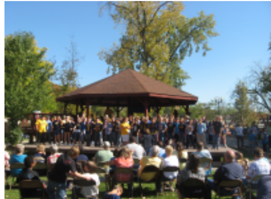
Fifth grade students performing at the Color Cruise & Island Festival

Fifty-six Beagle fifth and sixth grade students have come together to form the BEAGLE RECORDER PERFORMING ENSEMBLE! They played music in the balcony at the Opera House during Home Tour weekend on December 4 th , and also at our holiday program!!